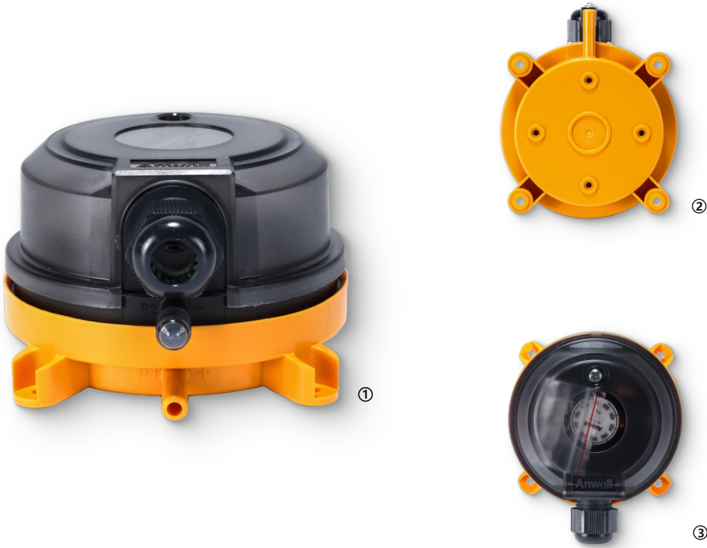
1)DPS52 front view 2)DPS52 bottom view 3)DPS52 upper part view

The DPS52 is an adjustable differential pressure switch capable of detecting miniscule changes in pressure due to the size and proven design. The switch set point or switching point can be field adjustable without the need of a manometer by simply using the adjustment knob and the built in calibrated visual scale. This switch is equipped a clear cover that not only protects the adjustment knob to be move involuntary but also provides class IP54 protection.